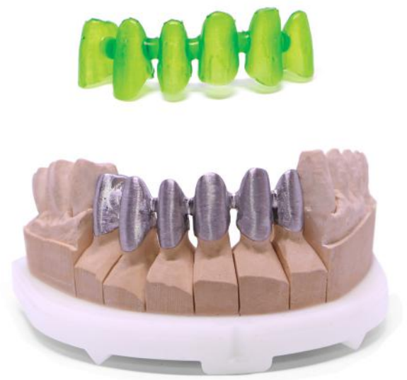
6 Units Bridge