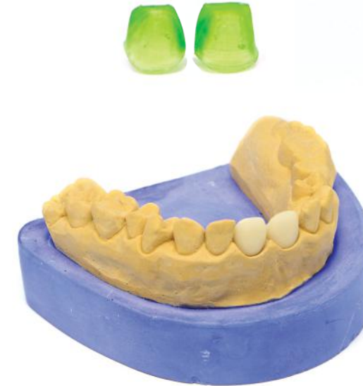
Emax Press Crown